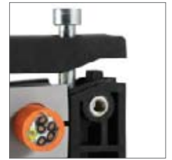
Also available with threaded bushings.